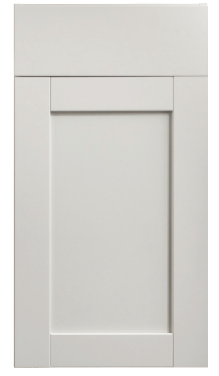
EMERSON STERLING SMARTSHIELD CARBON SMARTSHIELD